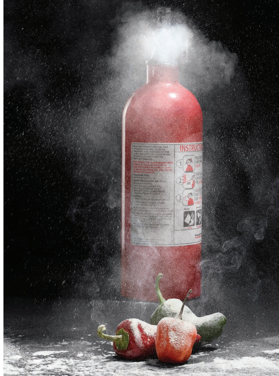
DR. OZ ILLUSTRATION BY KATHRYN RATHKE

Next Best Thing → Minimize your evening meal. The smaller your servings, the faster your stomach digests